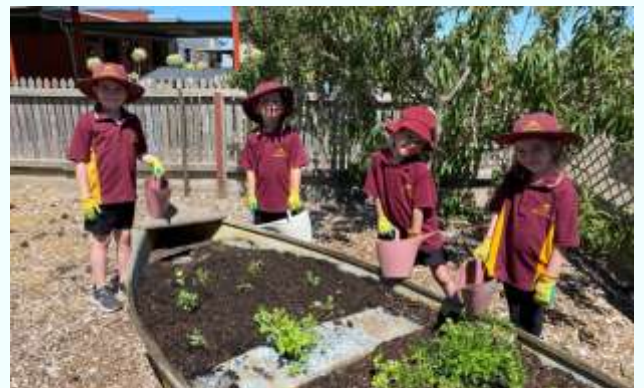
Students at Creswick North PS working in the veggie and herb garden