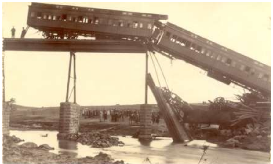
Railway accident at McCallum's Bridge, Creswick Maryborough Line, 19 August, 1909

With the increased use of private motor vehicles, rail use declined in the latter half of the twentieth century, and Creswick ceased to be a stopping point for trains. With the restoration of the rail service and building of a new station in 2012, there was an increased interest in this form of transport. Thanks to the enthusiasm of a Friends of Creswick Rail Group, led by Councillor Henderson, the former railway station is under repair and restoration. The difference is in the type of trains now in use. No soot in the eyes from these swift beasts as they scuttle across the countryside. No dog-box carriages, no wooden bench seats, just comfort for the travellers and an even speedier journey.