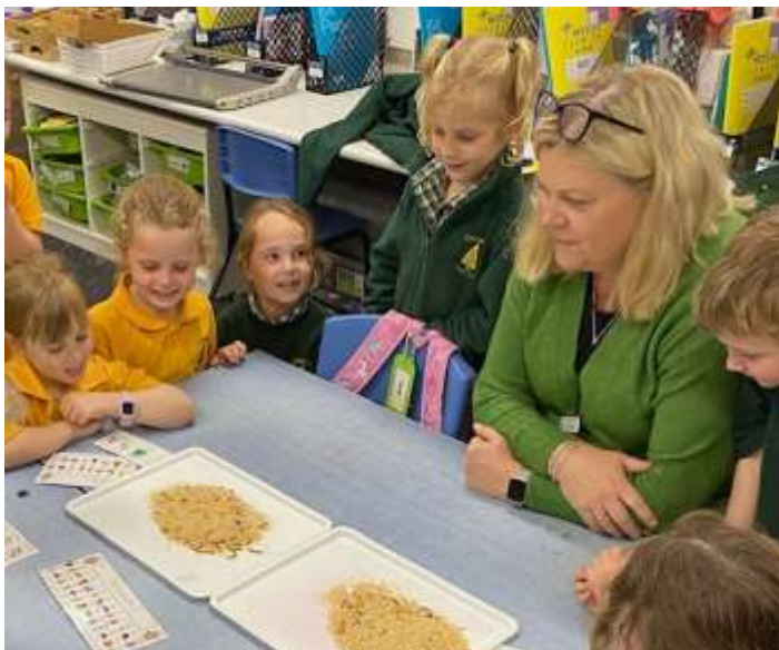
Preps doing science at Creswick Primary School