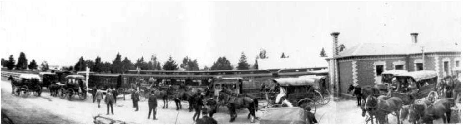
Visit of Commissioners at Creswick Railway Station

To celebrate the 150 years since the railway came to Creswick, this article is re-printed with the permission of the Creswick & District Historical Society