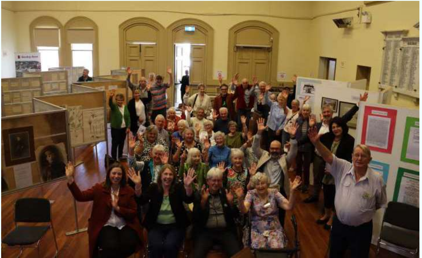
Creswick & District Historical Society Exhibition