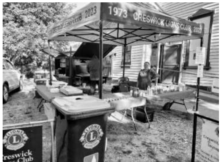
Katie, one of our wonderful volunteers, ready for action at our new Creswick Market site.