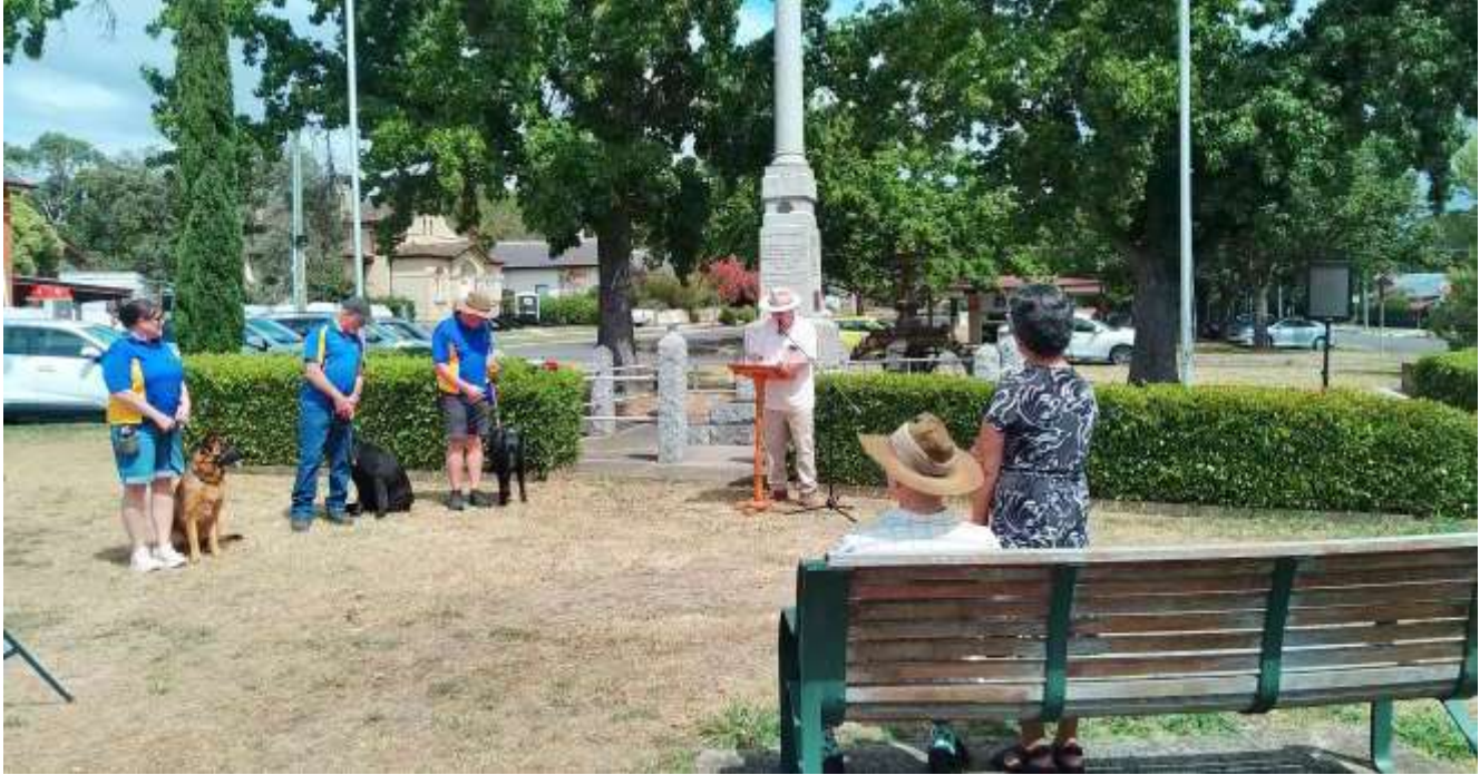
Commemorating the National Day for War Animals on February 24.

Representing the war animals were dogs from the German Shepherd Club of Australia - Ballarat Branch