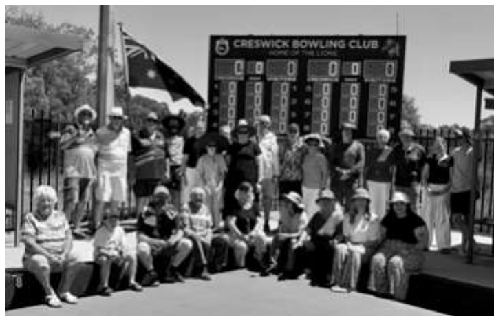
Community members on Australia Day 2026.