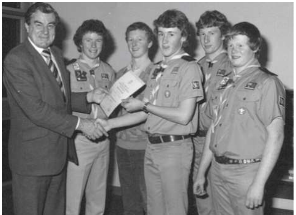
Presentation Dinner for Queen's Scout and Duke of Edinburgh Awards held on 14 July 1983

Registered 15512 on 15/5/1951 ph 0407 418 745