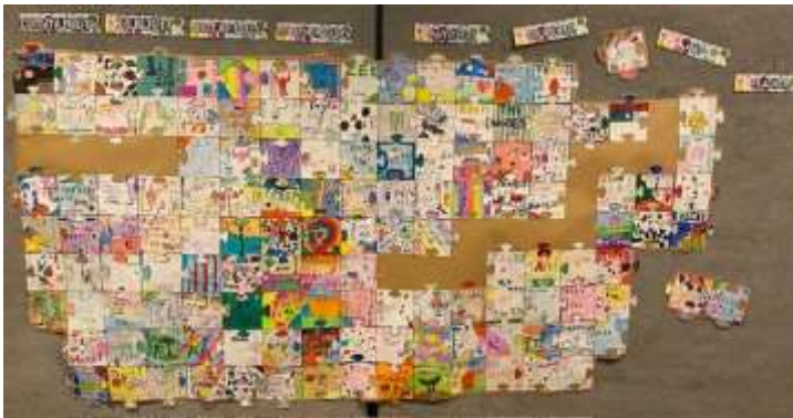
Our community is built piece by piece together with families, students and teachers