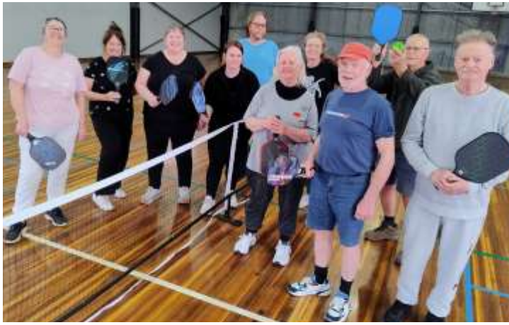
Clunes Hit and Giggle Pickleball celebrates its first year See article page 3