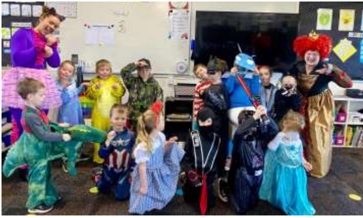
Creswick North Primary School Foundation students dressing up for Book Week