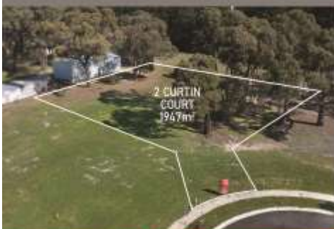
2 Curtin Court, Creswick