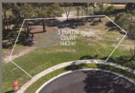
3 Curtin Court, Creswick

2 Curtin Court enjoys all the benefits of a lifestyle allotment within a residential area, measuring 1947m 2 approx. in total with a generous building area.