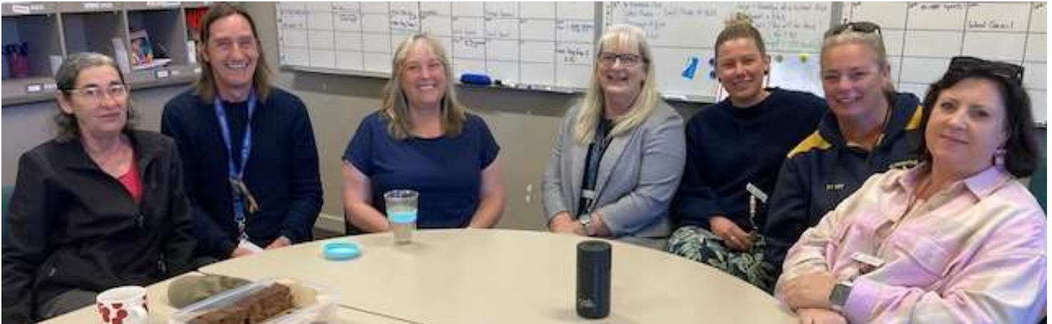
Creswick PS Education Support Staff