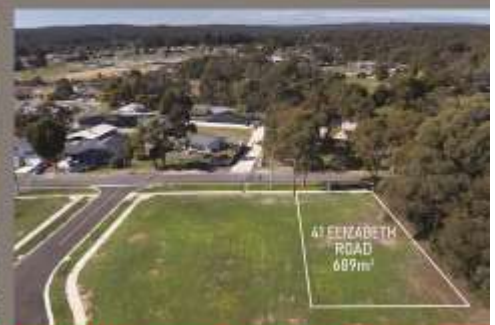
41 Elizabeth Road, Creswick

Spanning 1,462 m 2 , the property includes a generous building envelope and the added benefit of rear access via a council-maintained fire track.