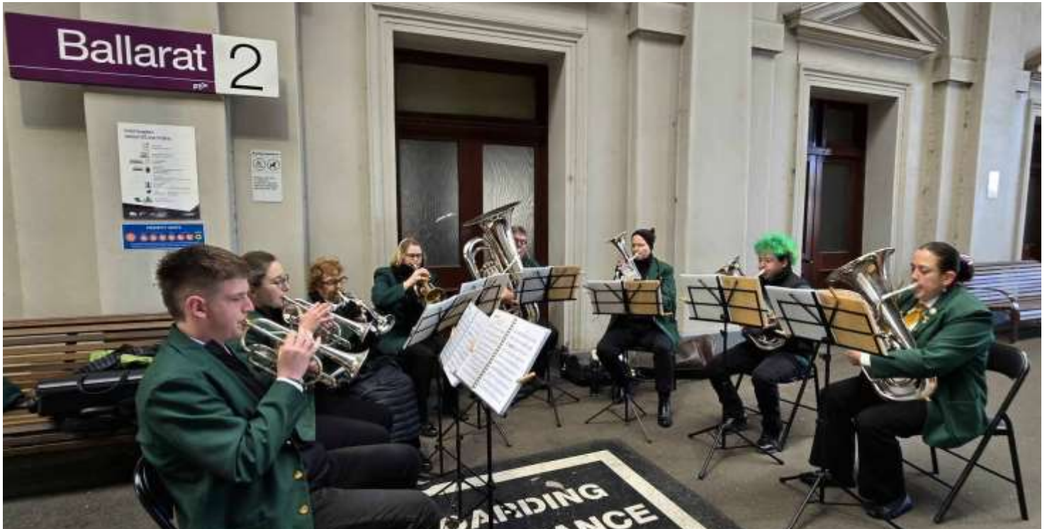
At Ballarat Station for Heritage Weekend

May has been another exciting and busy month! Those who attended the Ballarat Heritage Festival might have caught the band performing at the Ballarat Station, entertaining travellers as they boarded the steam train. It was a wonderful opportunity to share music in a unique setting.