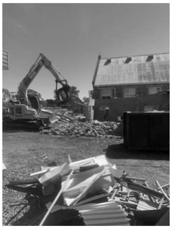
Demolition prior to re-building