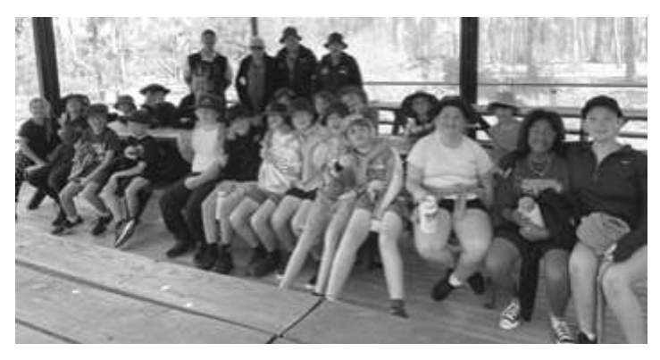
Students attending Fishcare at Lake Dewar

Years 4 - 6 students went fishing at Lake Dewar near Myrniong with the Fishcare team and had a wonderful day. The fish were relatively quiet but they did catch a few of a good size. After fishing some snags on the BBQ were enjoyed, finishing a great day out.