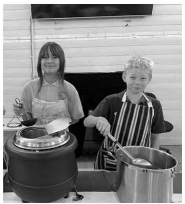
Students helping at the Creswick Neighbourhood Centre